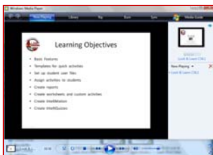
Screen Shot from Classroom Suite 4.1 Look & Learn Video

Perfect for the educator who missed the training—or is new to the school district! The Look & Learn Video links to the workbook for hands-on practice—great for training a single educator.