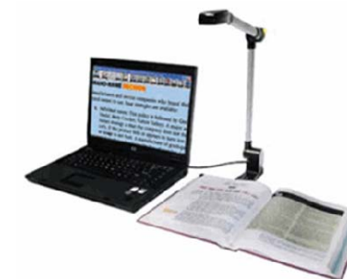
WYNN 6 with Pearl Document Camera Pearl Camera is lightweight and portable

◆ Skim Read: Quickly check out what's in a document before reading it thoroughly. (cont'd on page 3)