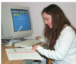
LAB Lessons help educators get up and running quickly.

Our tutorial CD allows schools to print up to 30 copies of a tutorial for staff or workshops. The price is $119.95 per title.