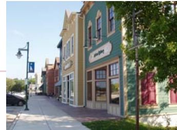
LAB Resources is located in the Old Main Street Center across from Pewaukee Lake.