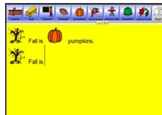
Picture banks can be added for beginning writers.