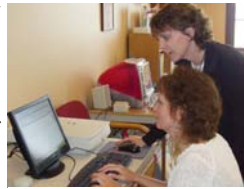
Inservice opportunities at LAB Resources