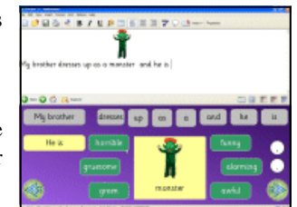
Clicker Screen with Grids

If you have any questions, or would like additional information, please call LAB Resources (262-691-3476 or 800-691-3476).