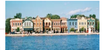
LAB Resources is located in the Old Main Street Center across from Pewaukee Lake.

Let's take a look at 2 widely used AT software programs that have been updated this fall.