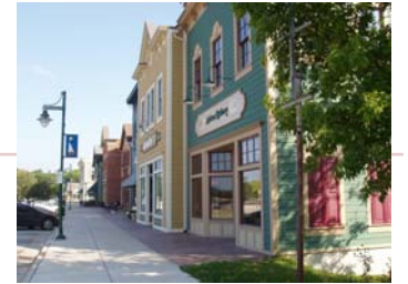
LAB Resources is located in the Old Main Street Center across from Pewaukee Lake.

For more information, please contact LAB Resources at 262-691-3476 or 800-691-3476. All orders must be received by October 31.